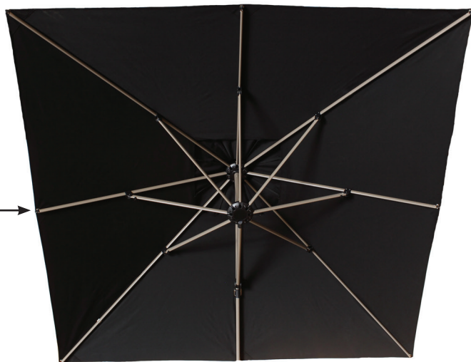
RIB & STRETCHER