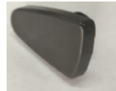
2 Rear Footpads