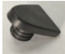
2 Front Footpads