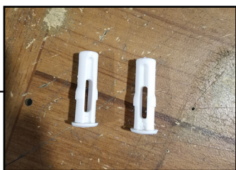
Pin USSP0096, USSP0097, USSP0347