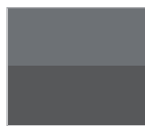
Titanium Gray/ Charcoal