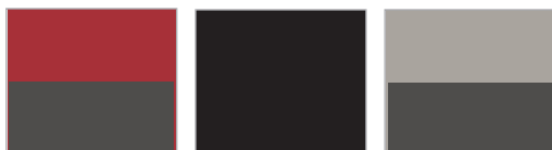
Apple Red/Charcoal Black/Black Titanium Gray/Charcoal

The classic, timeless design of the Plazza barstool fits both contemporary and traditional indoor styles. Features a curved backrest for optimal comfort.